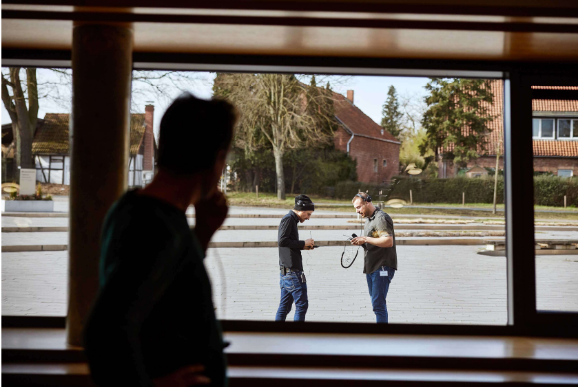
Walk test in progress