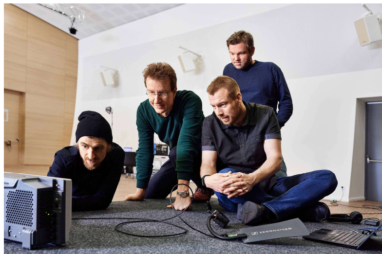
The team checking the RF environment

With WMAS it will be much easier as everything is digital, also the in-ears: I can place all units next to each other if I'm really in need of space. And that's why I wanted to do this test.