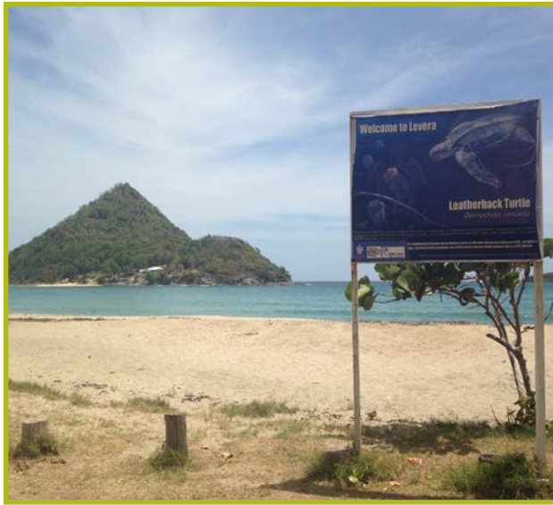
Protected areas in Grenada protect the rich natural heritage.