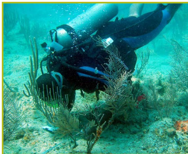
Economic development in the small islands of the OECS is reliant on healthy natural ecosystems like the forests of St. Vincent and the coral reefs of the BVI.

Indeed, a GE is simply a novel, enlightened economic and social development pathway that is based on environmentally friendly values and strategies that support sustainable livelihood activities and socio-economic development at community, countrywide and regional levels.