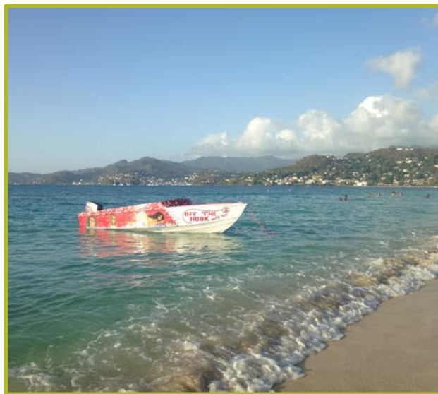
Development of Grande Anse beach is one element of Grenada’s Blue Growth Coastal Master Plan.

Martinique: Initiatives in waste management/ recycling, energy, biodiversity, and most critically vehicle emissions (based on EU standards) can provide models with