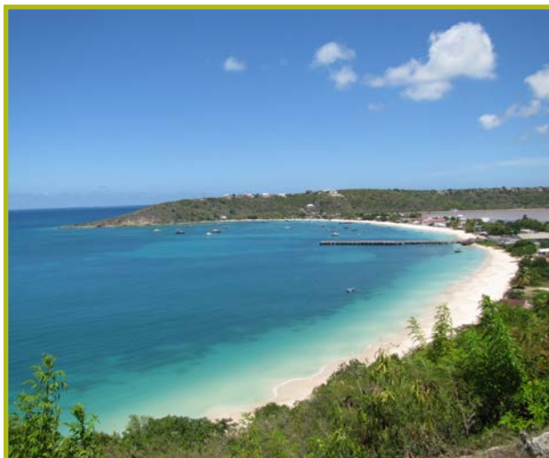
Anguilla's protected harbours are key to its economic development.

Anguilla: CANARI conducted a GE scoping study in Anguilla (CANARI 2013), which concluded that: "(a) There is an extensive body of knowledge available on natural resource management in Anguilla. However, the data is strewn over multiple scientific studies, consultant reports, regional reports and approved and draft legislation, policies and plans. This makes it extremely difficult to use this information effectively for decision-making. (b) The framework for natural resource management is made up of a range of policy documents and laws and regulations that have been developed in the absence of an approved integrated approach to environmental management. "