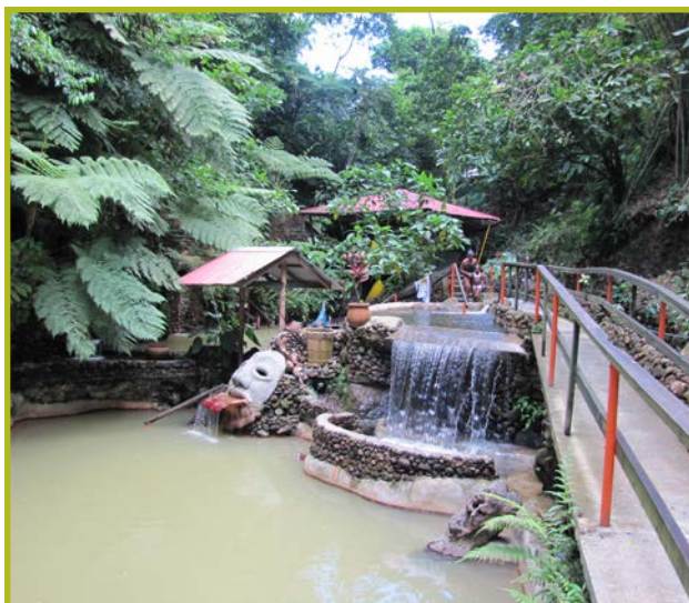
Dominica's natural hot springs are an attraction for locals and visitors alike and support local green enterprises.

marine spatial plans and national ocean policies and strategies through active citizen engagement; ocean education in conjunction with the private sector; mapping ocean assets and enhancing OECS ocean data coverage and access through collaborative public-private platforms.