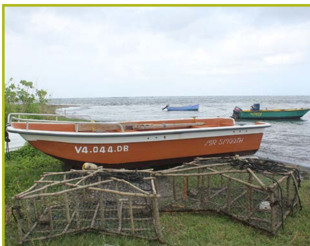
Small scale fisheries in St. Kitts and Nevis are important for food security and livelihoods.