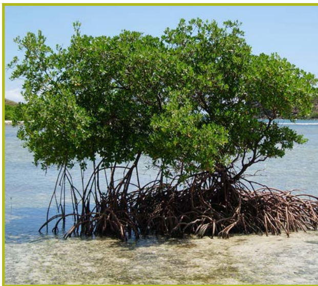
Most of the mangroves in the BVI were destroyed by 2017 hurricanes, leaving coastlines vulnerable.

recovery efforts post-Irma, the BVI is considering how it can rebuild greener overall and not “just back to the same old same.”