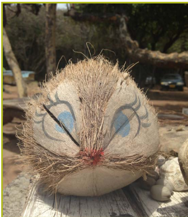
Caribbean culture is intimately tied to the natural environment.