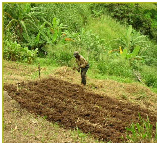
Small scale farming contributes to food security in Montserrat.