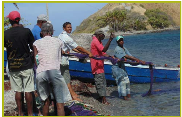
Valuing natural ecosystems, like those found along the coast of the OECS, like these fishers in Dominica, must be at the centre of economic transformation.

governed, competitive, socially inclusive economy is to take shape.