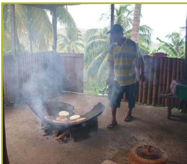
Traditional cassava bread is still made by the Kalinago people of Dominica.

economy idea is mainstreamed and receives the highest consideration by the most important policy advisers, formulators and decision-makers. It is essential to state that it is ultimately the OECS countries themselves who would have to lead and champion the GE transition process if it is to succeed.