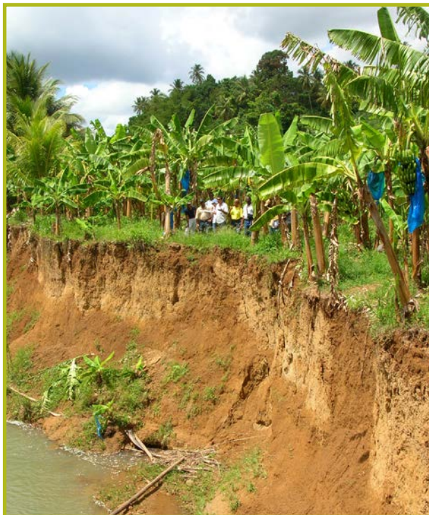
Farms in Saint Lucia are vulnerable to heavy rainfall that washes away riverbanks.

Development within the Caribbean region, particularly among the smaller, resource-poor member states and territories of the Eastern Caribbean is at the crossroads. Economic performance since 2010 has been characterised by low and inconsistent growth, precarious national debt profiles, unsustainable fiscal positions, high unemployment, eroding economic competitiveness, declining national savings, falling inward investments, a widening poverty gap, disturbing levels of violent crime, and unpredictable weather patterns disrupting economic activities. Additionally, the islands in the sub-region share many challenges, including constricted sizes and population, narrow production possibilities, lack of economies of scale, acute vulnerability to external shocks including climate change, and underperforming economic and political governance structures. The resultant economic uncertainty has led to increasing social upheaval, marked environmental degradation and greater marginalisation of the more vulnerable populace.