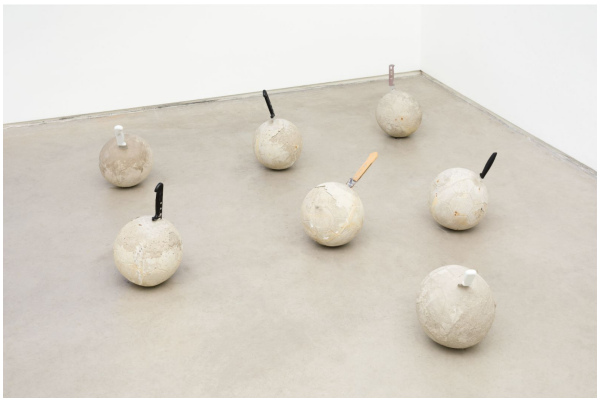
Paulo Nazareth, Várzea , 2020 in At The Luss House: Blum & Poe, Mendes Wood DM and Object & Thing