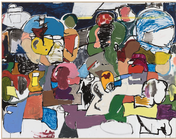
Eddie Martinez, Ideal Location , 2021, in At The Luss House: Blum & Poe, Mendes Wood DM and Object & Thing