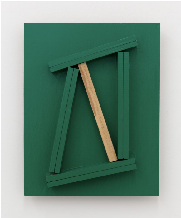
Kishio Suga, Vacillating Partitions , 2013/2017, in At The Luss House: Blum & Poe, Mendes Wood DM and Object & Thing ; © Kishio Suga, Courtesy of the artist and Blum & Poe, Los Angeles/New York/Tokyo