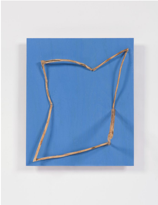
Kishio Suga, Scene of Elapsing Connections , 2009, in At The Luss House: Blum & Poe, Mendes Wood DM and Object & Thing