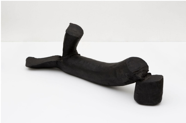
Paulo Monteiro, Untitled , 2018, in At The Luss House: Blum & Poe, Mendes Wood DM and Object & Thing ; Courtesy of the artist and Mendes Wood DM, Saõ Paulo/Brussels/New York