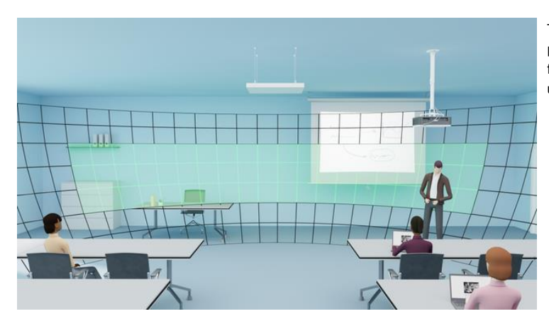
TCC 2 allows you to determine priority zones (pictured green) for uninterrupted speech pickup

Via the Sennheiser Control Cockpit app, priority zones and advanced exclusion zones can be created to define areas where audio is predominantly picked up and to exclude noise sources, respectively.