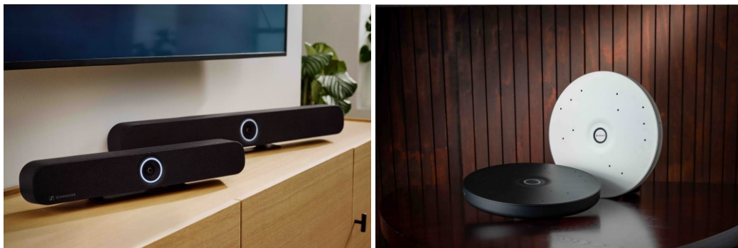
Sennheiser’s TeamConnect Family solutions