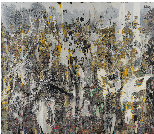
Mark Bradford. Nobody Knows the Trouble I've Seen Hauser & Wirth Monaco 28 September 2023 – 10 February 2024

October 2023 and will remain on view through January 2024. Henry Taylor's exhibition in Paris will comprise a wide range of works encompassing the remarkable breadth of his practice, from painting to sculpture to installation. Throughout his four-decade career, Taylor has simultaneously embraced and rejected the tenets of traditional painting, creating a visual language unique to his practice that defies categorization. The artist's vast body of highly personal work is rooted in his encounters with and perceptions of the individuals and communities closest to him, often framed with poignant or pointed historical and contemporary cultural references. In preparation for his October exhibition, Taylor will extend his studio practice to Paris for a residency in the city during the months of June and July.