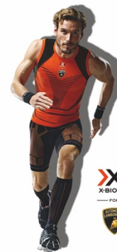
4 | X-BIONIC® Global market leader for high-tech sportswear