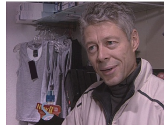
3 | Dr Thomas Wessinghage