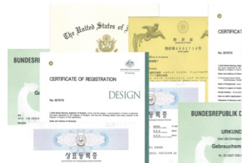
2 | X-SOCKS® – more than 414 patent registrations and registered designs