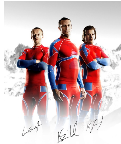
5 | X-SOCKS® was on the winner's podium 19 times

Expectations are high. X-SOCKS® provided top performance and won. The Norwegian team collected a total of 19 medals while wearing X-SOCKS®, 2 gold medals, 8 silver medals, and 9 bronze medals. More medals would follow year after year.