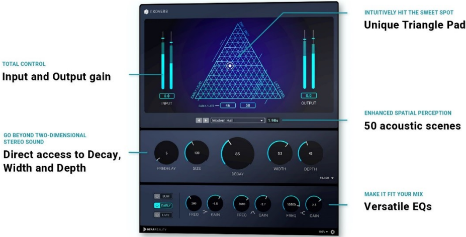
The EXOVERB user interface

co-CEO of Dear Reality, adding that “with EXOVERB, we unlock this capability by applying the fundamentals of our spatial audio technology to our first pure stereo reverb plugin.”