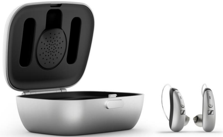
Pictured: All-Day Clear and the included charging dock