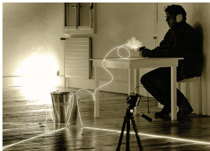
1992 Vitesse