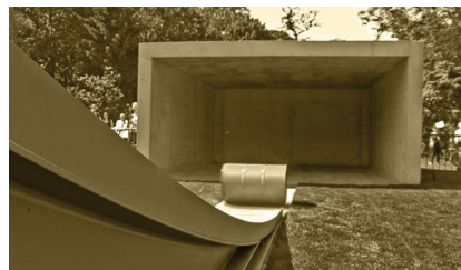
2012 Bidon Bleu – Videostill