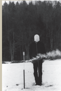
1983 Cap with Rocket

Signer does however appreciate the absurdism of the Dadaists. Which he clearly demonstrates in Cap with Rocket (1983), in which a rocket pulls a cap off of the artist's head. Although his actions are not functional, his oeuvre evinces a great interest in the reality that lies outside of the art world. His actions, without function but also not entirely without danger, can also be read as symbols or metaphors of an existential questioning.