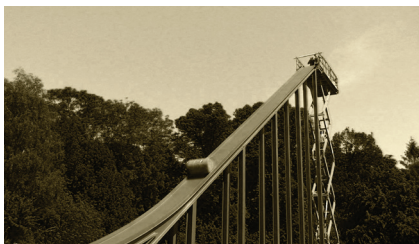
2012 Bidon Bleu – Videostill

Movement and static moments, past and future: Signer does not see them as opposites but rather as aspects of a single work. Since the phases are clearly defined and their order unchanging, the process can be repeated mentally and hence also be experienced in our imagination. In this way, the work compels the viewer to follow its trajectory from the physical to the conceptual.