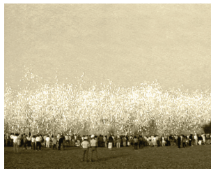
1987 Documenta 8, Aktion – Filmstill TV