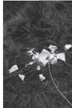
1974 Power of Rain – photo Roman Signer

From 1975 onward, explosives will further inspire Signer's research into the effects of natural forces like gravity, friction, shrinkage or expansion. Since that time, he uses explosions to set objects in motion or change their shape.