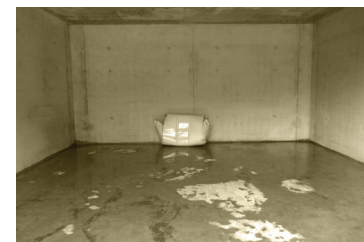
2012 Bidon Bleu – Videostill, photo Aleksandra Signer

concrete, steel 1500 cm × 600 cm × 3700 cm Collection Middelheim Museum