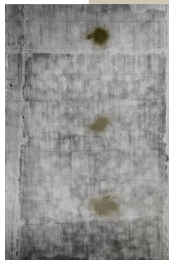
2007 Drei Farbkanonen

and was selected for prestigious art events like the Venice Biennale, Documenta 8 in Kassel and Skulptur Projekte Münster. Over the past 40 years, he has participated in hundreds of solo and group projects, including Documenta 8, Skulptur Projekte Münster and the Swiss Pavilion of the 48th Venice Biennale. His work is included in important collections, from Tasmania to Mexico (Kunsthau Zug alone owns more than ninety works of his). He has also created a number of works for the public space, especially in Switzerland, such as Tisch (2008, Appenzell), Koffer and Drei Farbkanonen (both in Zurich, 2007). Although his work is shown around the world, he has a special connection with the Kunstmuseum St. Gallen. There, in his backyard, can be found a significant part of his oeuvre.