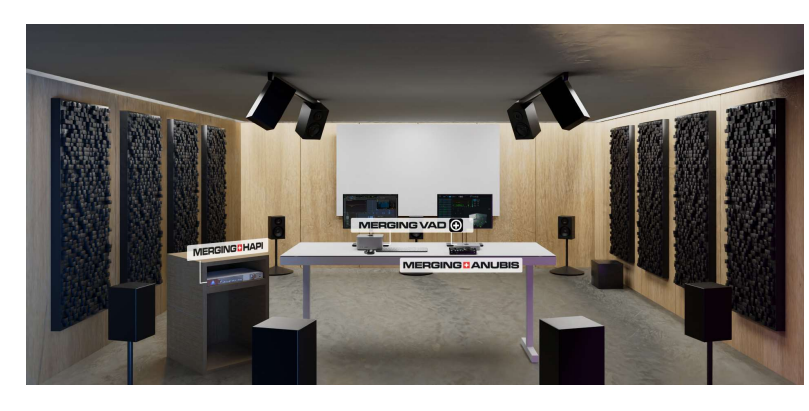
The Atmos bundle from Merging Technologies includes the Anubis Pro, Hapi MK II, VAD and SoundID – a nocompromise 9.1.6 immersive audio package

In the same space, visitors are invited to experience Dear Reality's dearVR SPATIAL CONNECT for Wwise. The software is previewed at IBC for the first time – and enables game designers to develop the audio directly in the VR or AR gaming environment, instead of having to switch between systems. The in-game mixing workflow will provide a revolutionary in-headset control of Wwise audio middleware sessions and will improve the workflow for next-generation XR productions.