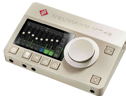
The Neumann MT 48 audio interface

For live audio applications, Neumann's KM small-diaphragm mics and the MCM Miniature Clip Mic System are on display, including the many dedicated mounting accessories that make MCM such a great choice for close-miking instruments.