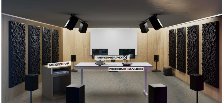
The Atmos bundle from Merging Technologies includes the Anubis Pro, Hapi MK II, VAD and SoundID – a no-compromise 9.1.6 immersive audio package

In the same space, visitors are invited to experience Dear Reality's dearVR SPATIAL CONNECT for Wwise. The software is previewed at IBC for the first time – and enables game designers to develop the audio directly in the VR or AR gaming environment, instead of having to switch between systems. The in-game mixing workflow will provide a revolutionary in-headset control of Wwise audio middleware sessions and will improve the workflow for next-generation XR productions.