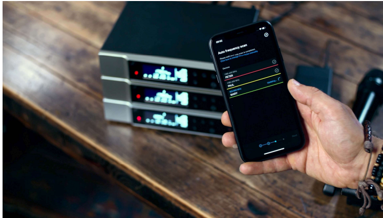
The Smart Assist app makes setting up a wireless system a breeze

Just like evolution wireless G4, Evolution Wireless Digital features a professional UHF connection between tour-proof transmitters and receivers, but it takes users from the analogue to the digital world. Digital wireless offers some sonic advantages over analogue, there is no RF noise floor, and the audio is crisp and clear. The latency of EW-D systems is at just 1.9 ms, which makes the sound feel natural and immediate, and thanks to the ultra-wide dynamic range of 134 dB on the transmitter, the EW-D wireless mic will handle very quiet and extremely loud sources effortlessly.