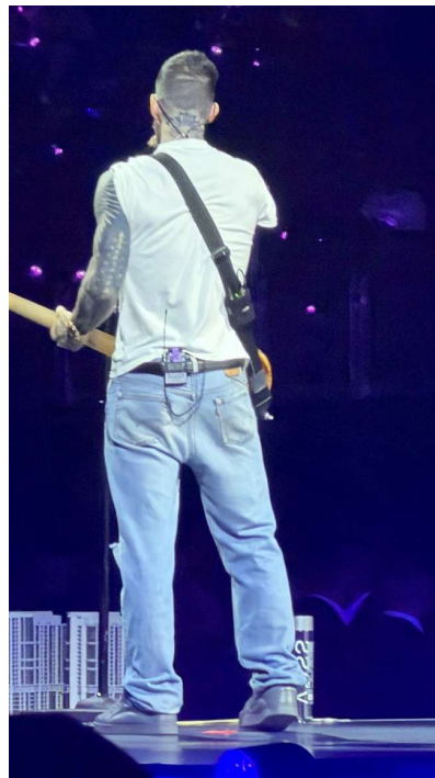
Frontman Adam Levine onstage using his Spectera bodypack and in-ear monitors during Maroon 5's Love Is Like tour