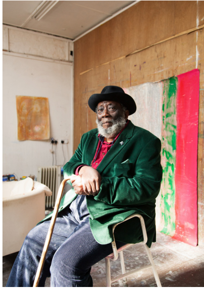
Frank Bowling. Penumbral Light Hauser & Wirth Zurich, Limmatstrasse 10 June – 20 August 2022

Over the course of six decades, Sir Frank Bowling has relentlessly pursued a practice which boldly expands the properties of paint. For the artist's first solo presentation in Switzerland, 'Frank Bowling. Penumbral Light', displays recent abstract paintings made mostly during the London lockdown in 2020. Following a period of ill health for the artist in 2019, the works trace the renewed energy and dynamism that Bowling channelled in the studio during his recovery. His restless reinvention of the painted plane endures in this current body of work, which continues to break new ground through the artist's use of multi-layered washes, thick impasto textures, acrylic gels, stitched canvas and metallic and pearlescent pigments.