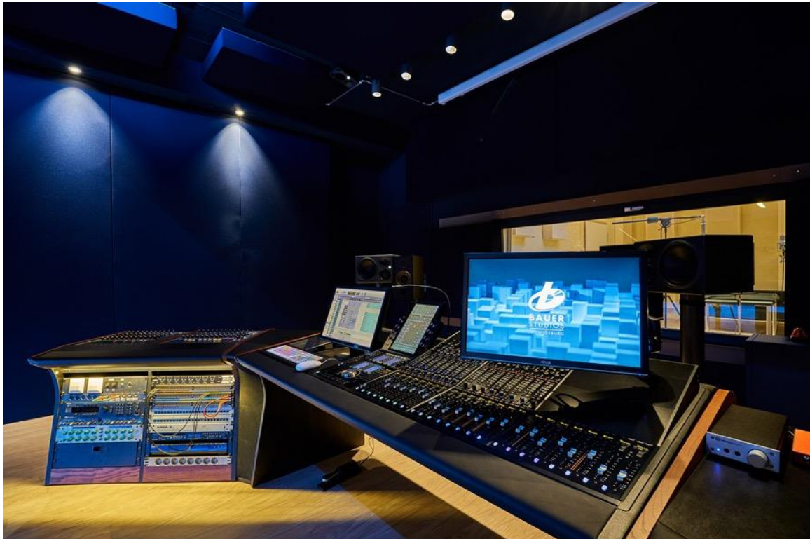
The redesigned Studio 2 is equipped with an Avid S6 console, which also serves as the monitor controller for the 5.1.4 or 7.1.4 setup.

The newly designed Studio 2, optimised by Markus Bertram (MB Akustik), was therefore to be equipped with a monitoring system that supports common surround formats as well as Dolby Atmos. When it came to choosing the loudspeakers, Neumann studio monitors were quickly selected as the first choice.