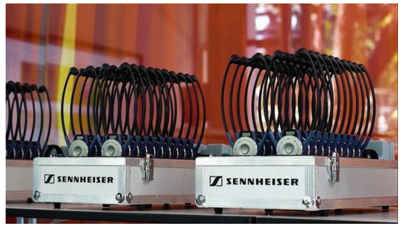
The Goethe-Institut Mexiko has been working with Sennheiser for several years now, relying on 160 TourGuide 2020-D headsets.

Although the <u>TCC2</u> came to revolutionize the way hybrid classes were conducted, the Goethe-Institut Mexiko was no stranger to the benefits of Sennheiser products. The Institute is also equipped with 160 <u>Tourguide 2020-D</u> headsets, two Digital Transmitters and a Mobile Transmitter that they use as a simultaneous translation system. This intuitive system requires no special technical knowledge, <u>Tourguide</u> 2020-D is the right solution for guided tours, conferences, assisted listening or simultaneous translation, and synchronizes quickly and easily at the touch of a button.