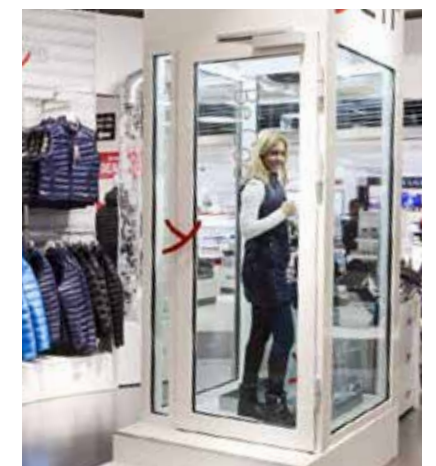
Yeti Cool room, -5°C.

outdoor: Premium Berlin, RePresent London, ClIFF Copenhagen International Fashion Fair, ISPO Munich and Outdoor Friedrichshafen.