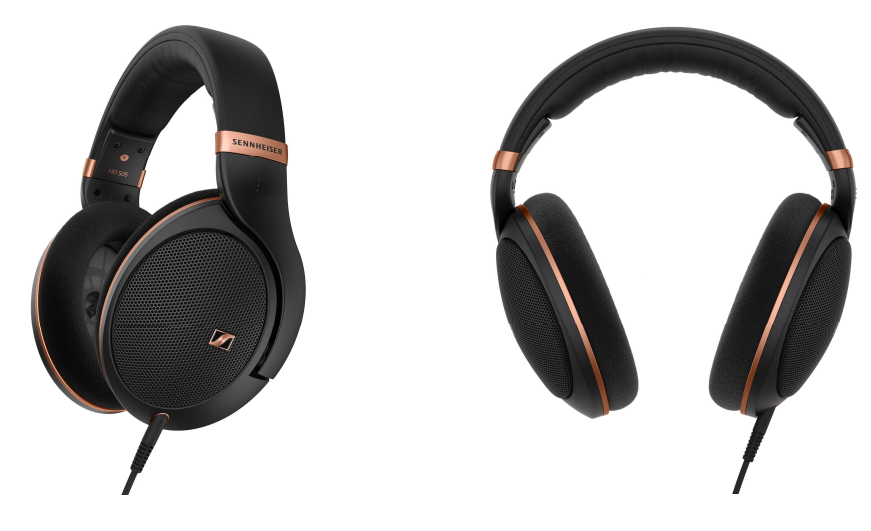
Pictured: The HD 505 offers a compelling way to get into audiophile listening

signature, with the punchy bass, effortless mids, and non-fatiguing treble the audiophile brand is lauded for. The angled transducers replicate the triangular positioning of a set of nearfield loudspeakers, resulting in an expansive soundstage that enables listeners to sit in the front row of their favorite music, movies, and games.