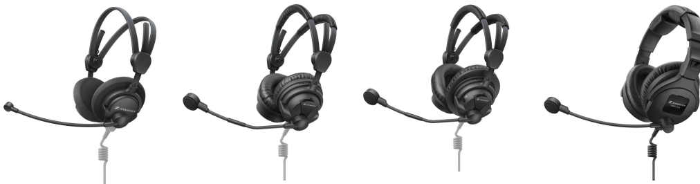
Sennheiser's portfolio of broadcast headsets has been streamlined and improved, pictured are (from left to right): the open HME 46; the closed, supra-aural HMD 26; the closed, circumaural HMDC 27 with NoiseGard active noise reduction; and the closed, circumaural HMD 300 X3K1 with included XLR-3/1/4" jack plug cable.

Except for the latter, all headsets need to be combined with a choice of XLR-3 / 1/4" jack, XLR-4F and XLR-5 M cables or unterminated cables (single and twin). All HME headsets are now designed to work with phantom power only.