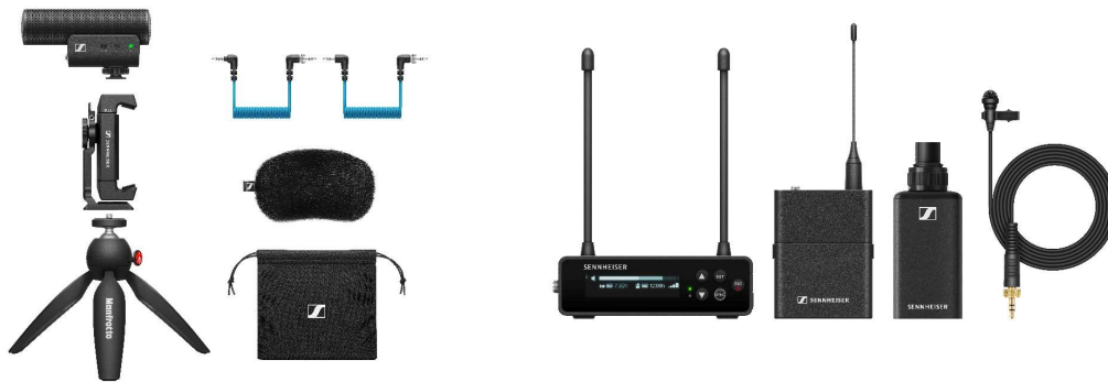
Global NAB promotion for the MKE 400, MKE 400 Mobile Kit (pictured, left) and all EW-DP UHF wireless microphone systems (pictured is the EW-DP ENG SET, right)

Promotional pricing commences Monday, April 15 th and will run through Sunday, May 19 th , 2024. Standard pricing will be back in effect on Monday, May 20 th , 2024.