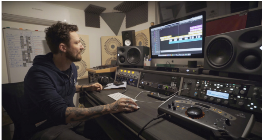
Frank Turner in his studio

“Sennheiser have been with me every step of the way on my journey into the world of being a producer, building my own studio, and learning how to record and mix music,” says Turner. “It’s a new passion for me, so I’m always keen to talk about it, and Sennheiser equipment helps me to capture and refine the sounds I’m looking for.”