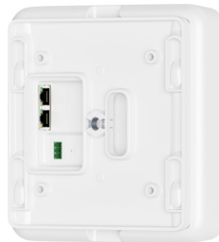
Rear view of the SpeechLine Multi-Channel Receiver with connection options and wall mount

The SpeechLine Multi-Channel Receiver can be unobtrusively wall- or ceiling-mounted using the included wall-mount adapter. For a quick on-site check, the receiver features status LEDs for the audio channels, otherwise it is configured and controlled via the convenient Sennheiser Control Cockpit software or via Sennheiser's open SSC protocol for third-party solutions.