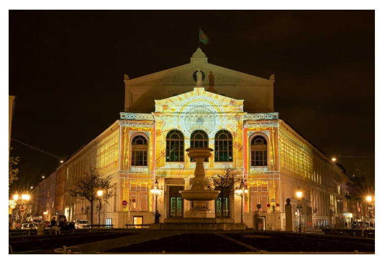
The Gärtnerplatztheater has adopted digital wireless microphones from Sennheiser

Wedemark, 2 November 2022 – The State Theatre on Gärtnerplatz, commonly known as the <u>Gärtnerplatztheater</u>, was opened in 1865 and its late-classical façade still characterises the ambience of the square in the centre of Munich that gives it its name. Last year, the theatre was converted to digital microphone technology from Sennheiser.