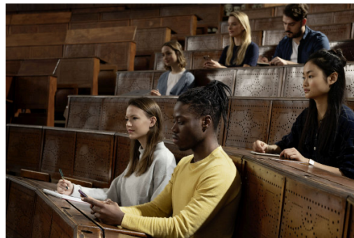
TruVoicelift ensures clear in-room audio for business and education applications