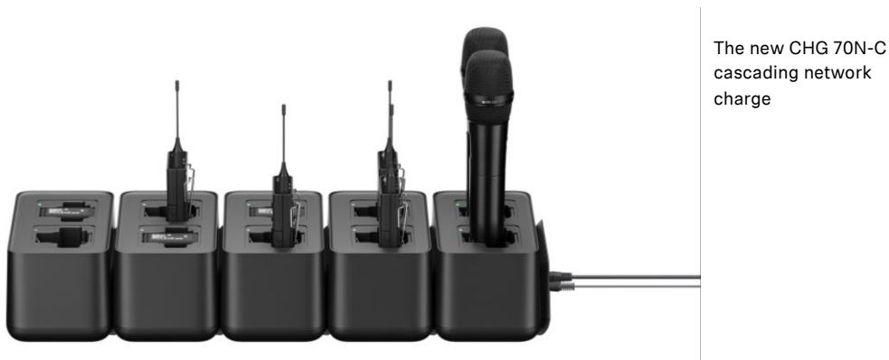
The new CHG 70N-C cascading network charge

Earlier this year, CHG 70N, a non-cascading variant of the EW-DX 2-bay network charger, began shipping to customers. Today, Sennheiser announces the replacement for CHG 70N, a network charger that can be cascaded (up to 5 x network charger units), named CHG 70N-C.