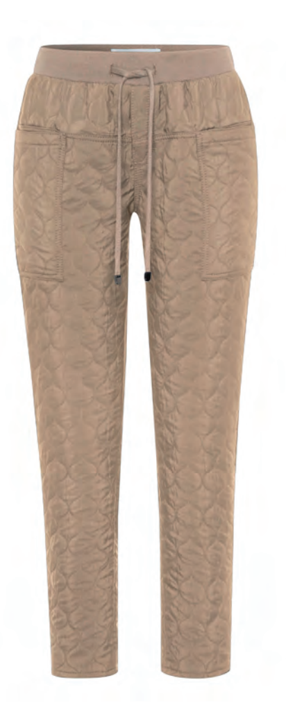
MERRIT S 79-4204/57