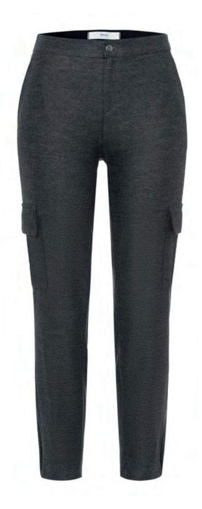
MORRIS S 79-5804/06