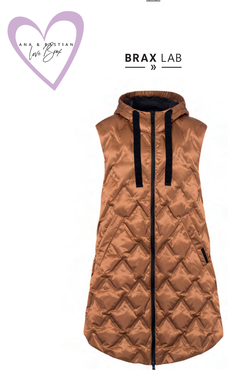
FAY L 99-8884/53