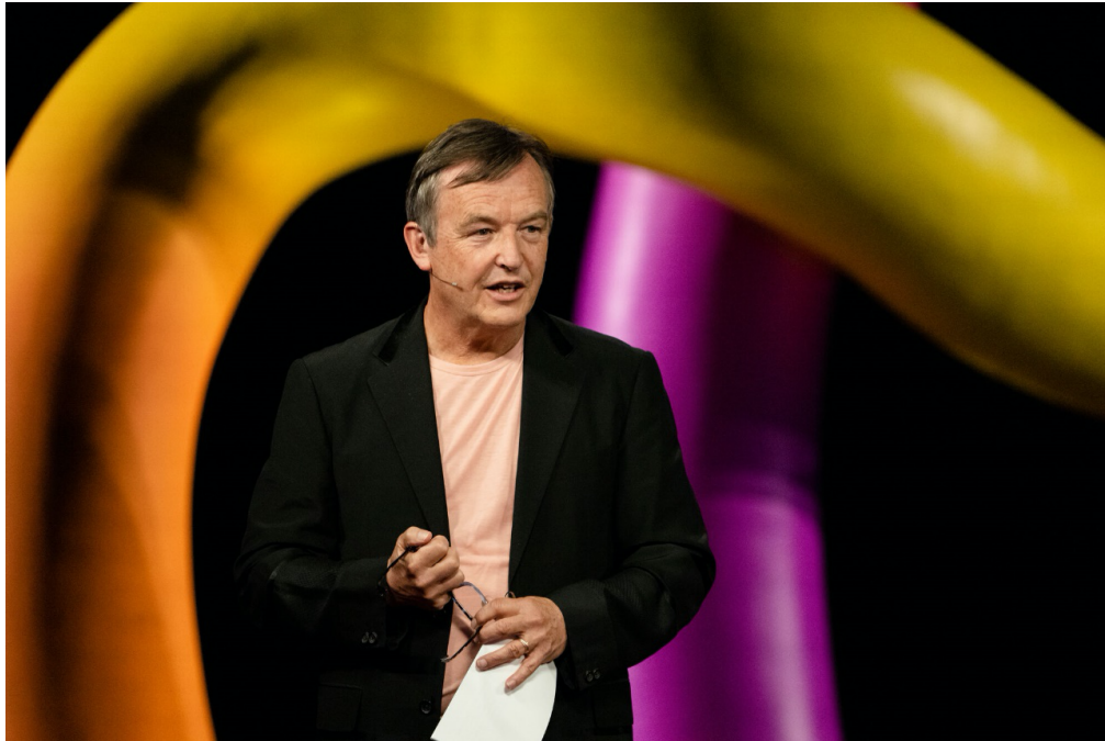
Chris Anderson, Head of TED delivers opening remarks wearing the custom Sennheiser headset

In their design collaboration, which involved various prototypes, Sennheiser achieved what TED was looking for in a headset microphone. The final design took elements from a few of Sennheiser's top products, melding them together in a stylishly streamlined package. The short boom arm and tiny microphone leveraged the transducer from the MKE 1 to give it the same top-of-the-line clarity and excellent frequency response found in musical and broadcast applications. The thin neckband allowed comfort for long wears, and the silver color gave it a modern yet subtle edge. While the design is unique to TED, it takes inspiration from Sennheiser's popular headset microphones that can be found all over Broadway productions and broadcast news studios.