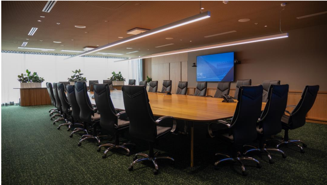
An example of the Flinders University boardroom equipped with Sennheiser gear.

Olie Taylor explains the audio setup: “We have three Sennheiser TeamConnect Ceiling 2 microphones over the space. From a microphone pickup perspective, we could easily have managed with two, or perhaps even one TCC 2, but Crestron recommended three to ensure we achieved the best resolution for the positional tracking provided by the mic arrays.”