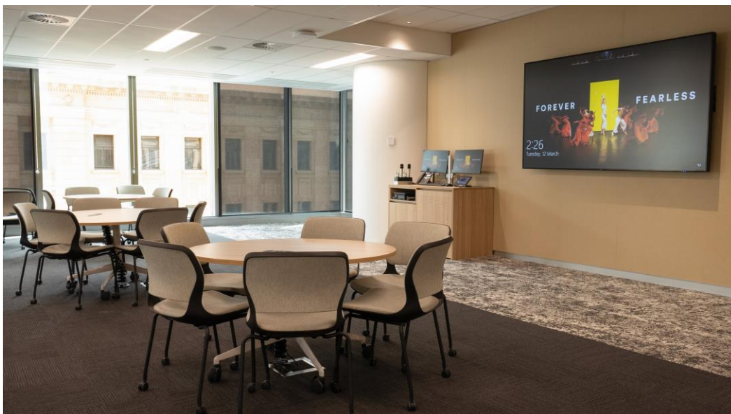
An example of one of the flexible teaching spaces at Flinders University.

In its lecture spaces, Flinders University installed a combination of TeamConnect Ceiling 2 microphones and SpeechLine Digital Wireless (SL DW) handheld and lapel microphones.